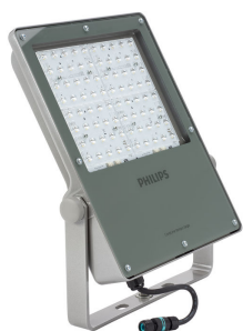
Coreline tempo large-BVP130